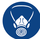
N-95 face mask