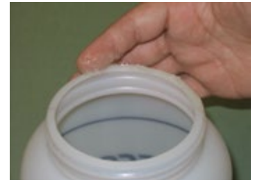
Petroleum Jelly on rim