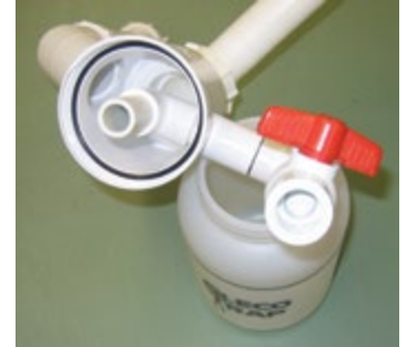
Properly seated O-Ring