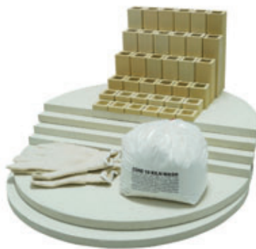
Furniture kit for a SM23T-3 kiln.

General Dimension Drawings: PDFs of all General Dimension drawings can be downloaded from each model page on our web site.