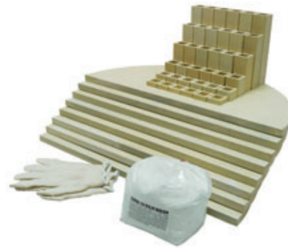
Furniture kit for a SM28T-3 kiln.