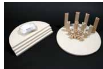
Furniture kit for a LB18-3 kiln with triangular post kit and cone 10 kiln wash.

General Dimension Drawings: Not available at this time.