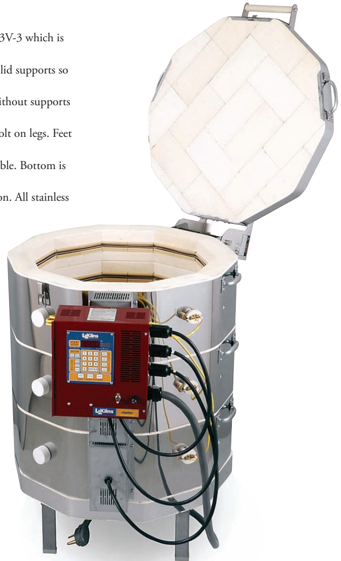
A JD230V-3 is shown with three sections.

UL Listing: c-MET-us listed to UL499 standards.