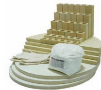
Furniture kit for a JD236V-3.