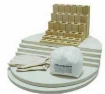
Furniture kit for a JD230V-3.