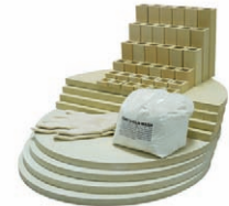
Furniture kit for a JD245V-3.