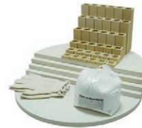
Furniture kit for a JD23V-3.

For all Dimensions and Weights: See hotkilns.com/jupiter-dimensions.pdf.