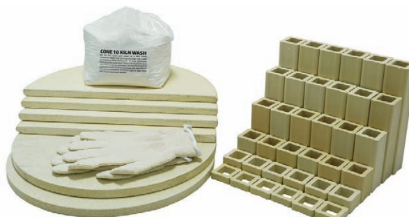
Furniture kit for a JD18X-3.