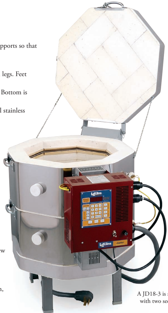
A JD18-3 is shown with two sections.

UL Listing: c-MET-us listed to UL499 standards.