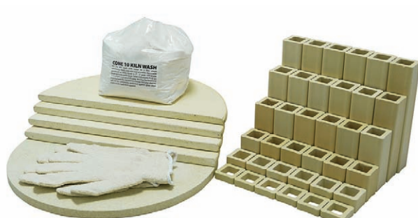
Furniture kit for a JD18-3.

For all Dimensions and Weights: See hotkilns.com/jupiter-dimensions.pdf.