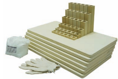
Furniture kit for an X3227-D.

Bell-Lift Dimensions: See hotkilns.com/lift.html.