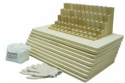
Furniture kit for an T3427-D

Bell-Lift Dimensions: See hotkilns.com/lift.html