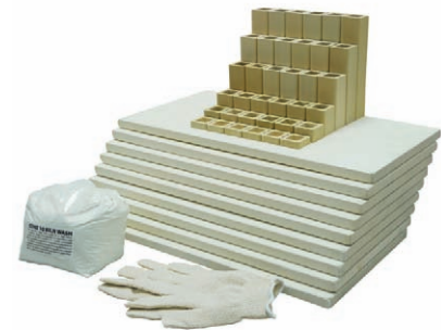
Furniture kit for an T2327-D

Bell-Lift Dimensions: See hotkilns.com/lift.html.