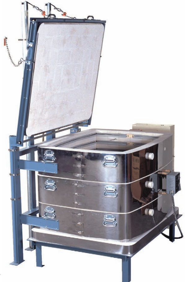
An T2327-D is shown with three sections. The control panel is mounted on the right side of the kiln. The handheld DynaTrol can be mounted on the wall (a 4 foot cord is included).

High Power Option: The T2327-D, T2336-D, & T2345-D can be ordered with extra power.